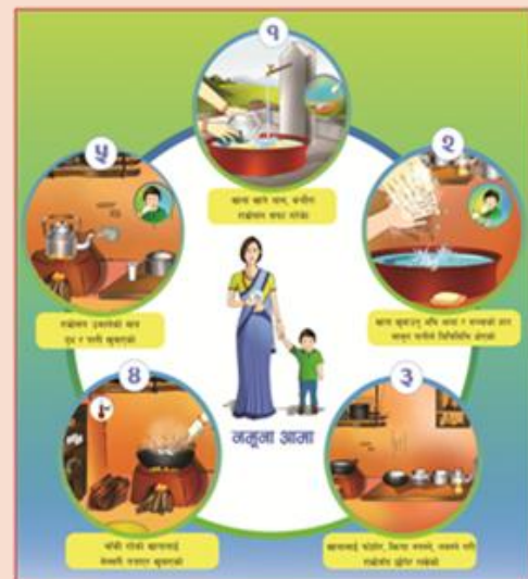
Five key food hygiene behaviours promoted in Nepal

Nepal: Building on the Mali and Bangladesh findings, SHARE funded the design, delivery and evaluation of an intervention to change the food hygiene behaviours of mothers in rural Nepal [28]. This consisted of a motivational package targeting five key food hygiene behaviours using emotional drivers rather than cognitive appeals as well as emphasis on change in behaviour settings. Four clusters received the intervention over a period of three months whilst four clusters remained a control group. Outcomes were measured in 239 households with a child aged 6-59 months. 43 percent of mothers were able to maintain all 5 key behaviours and the intervention was successful in significantly improving the microbiological indicators in child food. The results suggest that it is possible to substantially improve food hygiene behaviour and reduce the risk of microbiological contamination of child foods through scalable community level interventions.